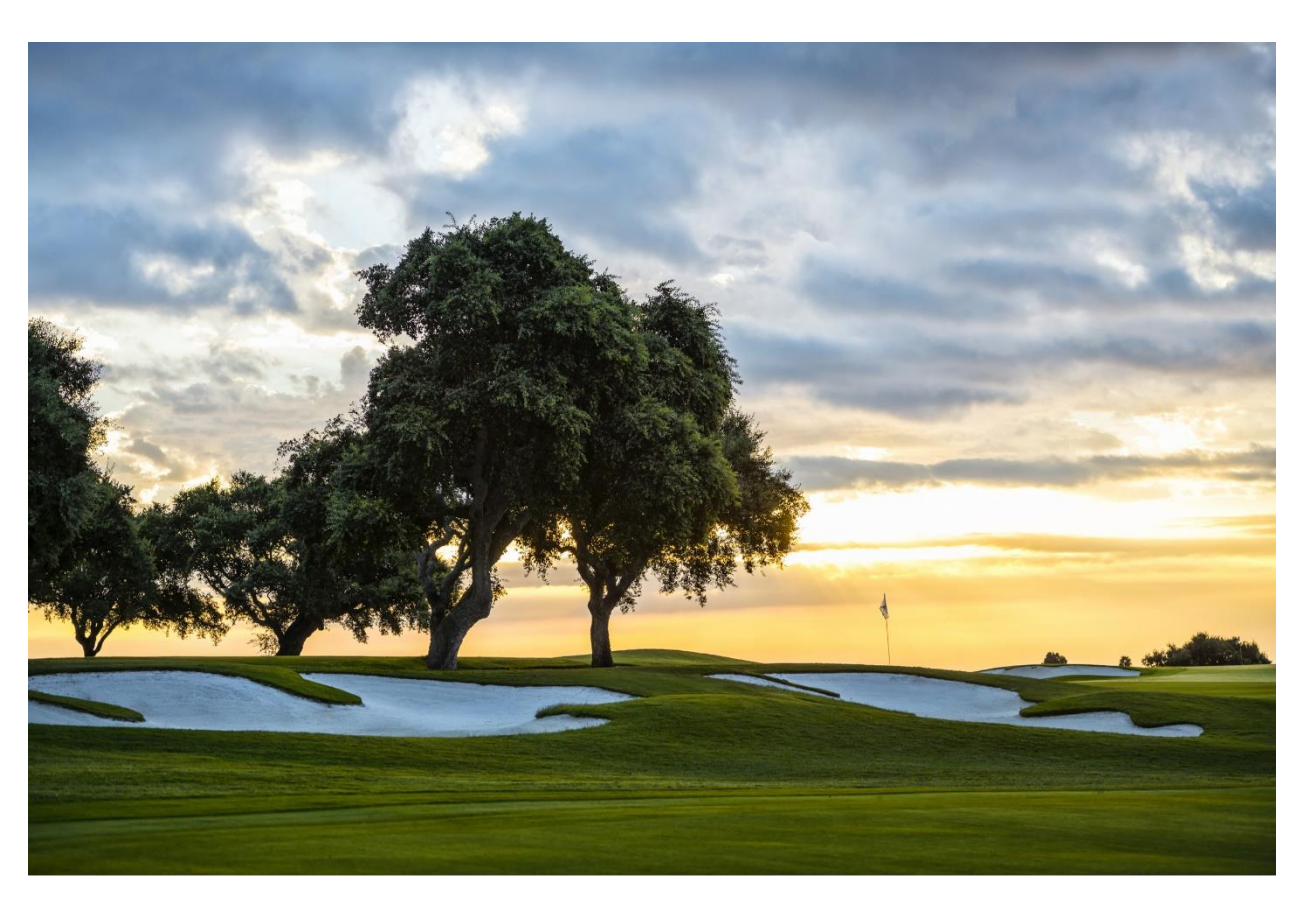
THE PRESTIGIOUS WEXFORD GOLF CLUB HOME TO THE DISTINCTIVE ARNOLD PALMER SIGNATURE GOLF COURSE